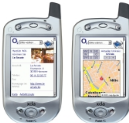
Figure 1: Examples of Location Based Advertising

Advertising that changes based on a user's location (LBA – Location Based Advertising) has been one of the much-talked-about capabilities of the wireless Internet, the idea being that an advertiser could reach a customer when he was most likely to buy. The advertising will be directed toward phone and PDA (personal digital assistant) users or passengers in public transport. "Wireless advertising makes the most sense when delivered contextually through media on a geo-targeted basis. Opt-in possibilities could allow device users who are strolling in a shopping mall or urban area, for example, to signal their readiness for local offers.