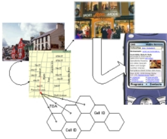
Figure 4: Location Based Pull Advertising on mobile devices

The basic scenario is: En route in the city, the user seeks the closest drugstore or maybe a good Italian restaurant. The user gives the service provider the indication that he looks for a special good and receives either out of the yellowpages content the desired information or gets according to the interest offers on special savings in the concerned area. Opt-in possibilities will allow device users who are strolling in a shopping mall or urban area, for example, to signal their readiness for local offers. Carriers or content providers could offer lower subscription rates for those who accept ads. Users willing to accept ads on their mobile devices will receive either push information (they get a advertising message with savings offerings) or pull information (users can request information e.g. yellowpages etc.).