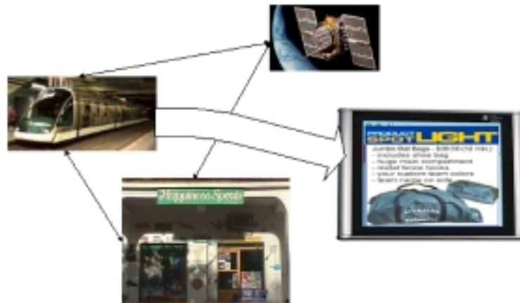
Figure 3: Location Based Push Advertising in public transport

Location Based Advertising on integrated displays in public transport systems have great potential. The passengers are normally bored when they ride with a public transport system (metro, bus, tram etc.) so they are to open general interest information and location based advertising (push approach). Therefore they will messages during their ride, mostly they get value-added information e.g. on events, special activities, opening hours of museums timetables, delays, city-activities etc.